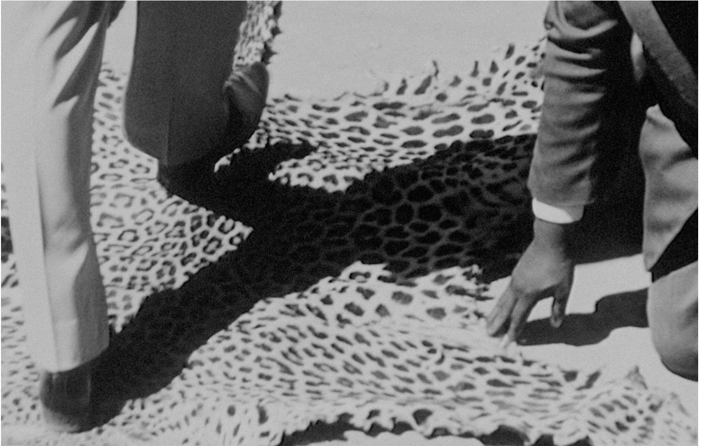
Jelena Jureša, Aphasia (2019), film still